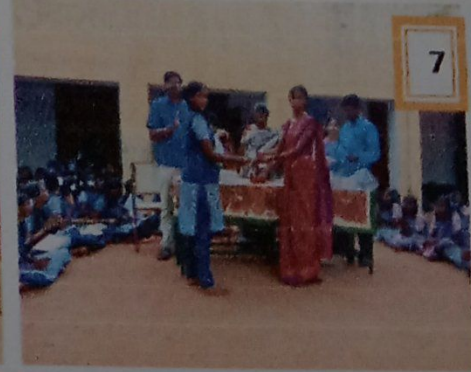
1. School Headmistress giving a prize to a winner 2. Assistant Headmistress giving a prize to a winner 3. Staff of school giving prize to a winner 4. Staff of school giving prize to a winner 5. Group photo of prize winners & 7. NMC staff giving prize to a winner.