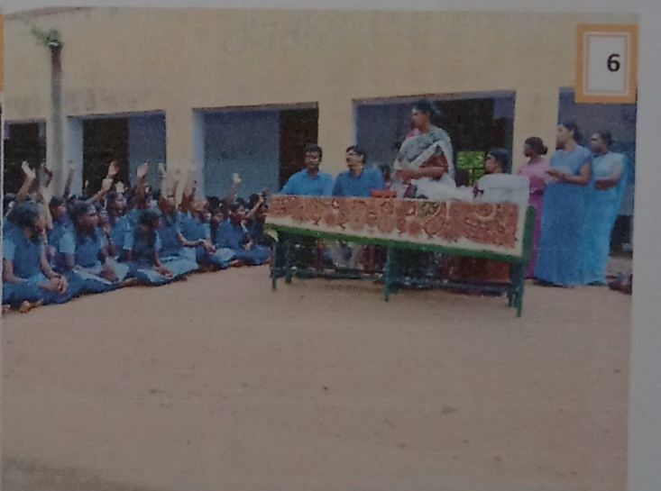
1. Objective model exam for commerce/science 2. Staff members of NMC giving instructions 3. English & Tamil oral competition 4. Group of participants of oral competition 5. Headmistress giving inaugural address 6. Headmistress interacting with students about the programme.