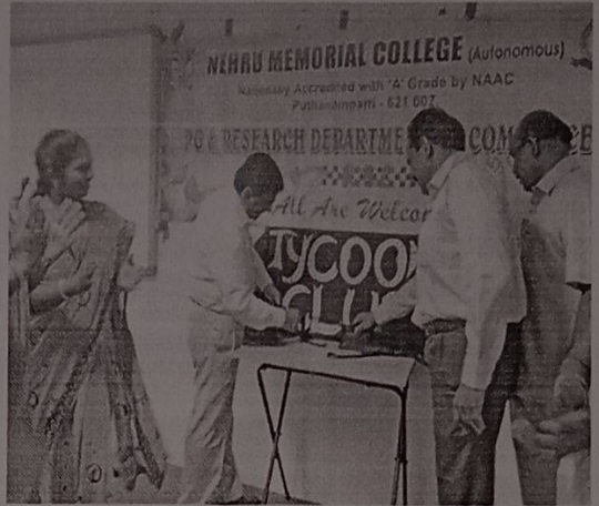
OPENING CEREMONY OF EDP CELL